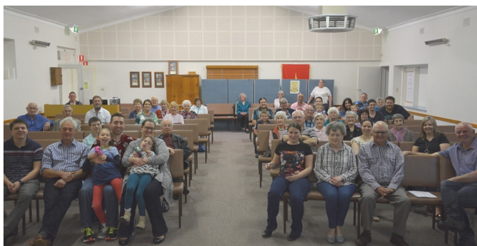
Hampstead Gardens Church of Christ

Soon the next stage of the Selfie Sunday website will be completed, and we will start to see the church portraits appear. I hope that EVERY Church of Christ in Australia will be part of the Big Picture!